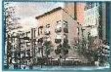
BAUGH & FELL ENTERTAINMENT NODE Developing text.