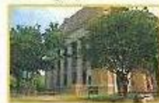
HIGH CULTURAL EDUCATION NODE Developing text.