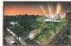
MIDTOWN PARK LIFESTYLE NODE Developing text.