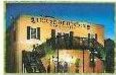
EMERSON MUSIC AND DANCE ENTERTAINMENT NODE Developing text.