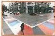
HIGH FASHION CREATIVE DISTRICT NODE Developing text.