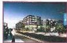
CULTURAL ART ENTERTAINMENT NODE Developing text.